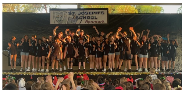
Year 6 final farewell