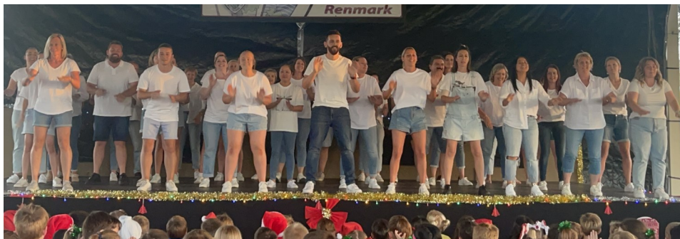
Staff performing at last nights Concert.

The results of Challenge Cup were announced today. 1st place ~ St Joseph Gold 17 points, 2nd ~ St Mary MacKillop Blue 15 points, 3rd ~ St Therese Red 14 points, and 4th ~ St Patrick Green 13 points. This activity promotes commitment, graciousness, inclusiveness, and accountability from our students. We commend them on their efforts for supporting the Challenge Cup for 2023.